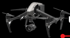
UAV (Air operator certificate ENAC)